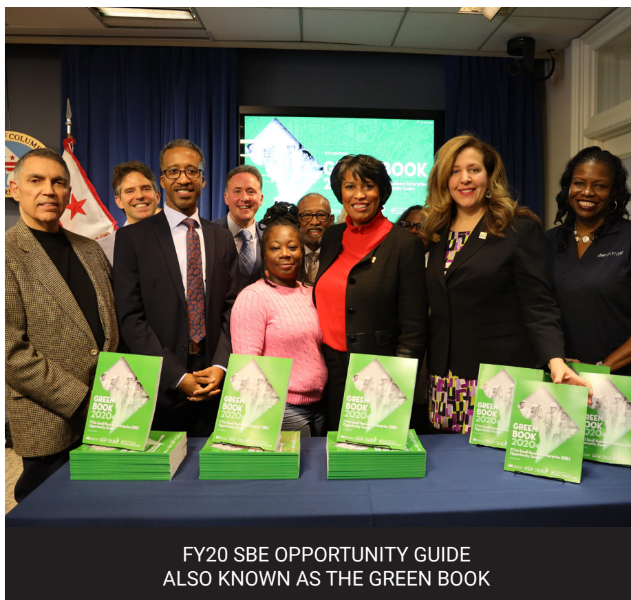
FY20 SBE OPPORTUNITY GUIDE ALSO KNOWN AS THE GREEN BOOK